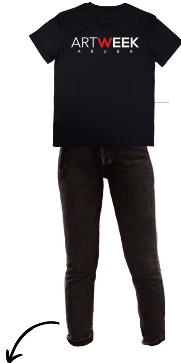
Work outfit during the events

For the event nights, such as the Art Table, Art Fair, and Art Fashion Show, you will be required to wear the official event shirt provided by the workplace, paired with black pants. We want to maintain a professional appearance throughout the events. Please note that the pants should not be sportswear, running or gym pants, or leggings, but rather jeans or trousers. Shorts are not allowed during the event nights.