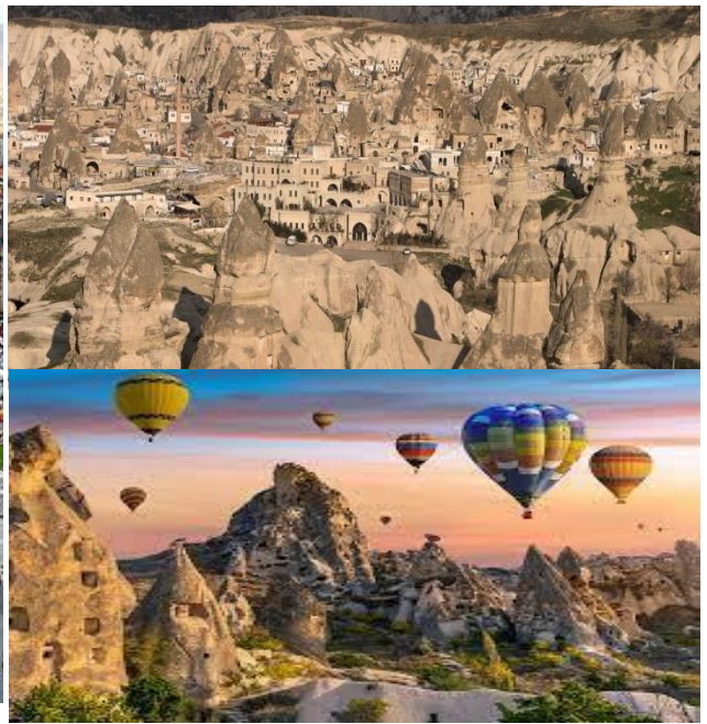
Who we are?

Established in Kayseri in 2013 as a youth stage, our association was named Kayseri Youth with a more inclusive name in 2019. It has updated its name as the Assembly Association. The main fields of activity, which our association has focused on since its establishment, are culture and art. and youth participation activities. Since the day it was founded, cultural activities such as theatre, drama, poetry and conversation. More than 50 local and national activities were carried out in these activities. Theater and voice-over courses are also the activities of the association.